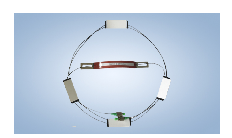
Sensor manufactured and sold by Technica under International License from The University of Illinois at Chicago.

Used extensively in various civil structures, including buildings, pillars, and bridges. Well suited for geotechnical applications.